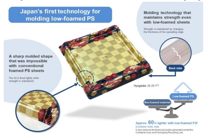
(*2) A large sushi container (new low-foamed PS container) featuring a significant reduction in the use of plastics

(*3) A sashimi container that enables the reduction of tsuma ("Tsuma Zero" container)